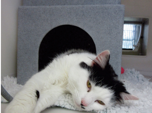
Figure 7 Providing the option of a hiding place will help cats relax, and may improve their adoptability

The amount of contact allowed or encouraged may vary by shelter, and will depend on careful balancing of factors such as pressure for throughput and disease prevalence. Hand-