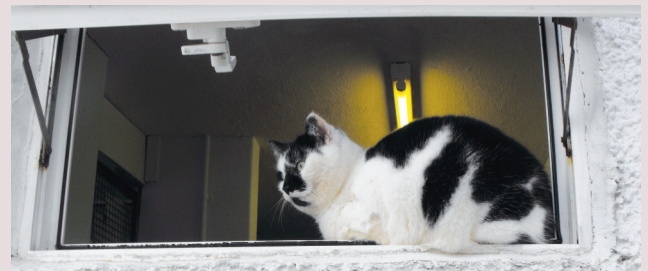
Figure 3 This photograph was taken at the same shelter as Figure 2. Here a cat guards the single access point to the larger outdoor enclosure, effectively negating the availability of that space and all its associated resources to other cats in the group

Where cats are group housed, it has been shown that frequent changes to group composition are important predictors of stress. 47 Therefore, in a shelter, group housing should be limited to small groups of cats (four to six individuals) with few to no new introductions until the group is adopted out or nearly so. Having a few smaller groups rather than one large group also facilitates monitoring and may help adopters feel less overwhelmed by choices.