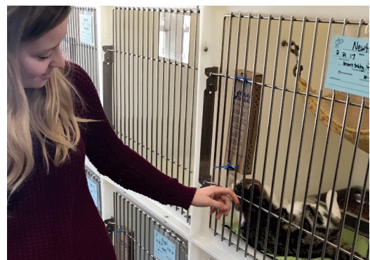
Figure 6 Interaction with a cat in adoption cage housing

While the objection may be raised that allowing adopters to touch cats (and cats to touch adopters) will spread disease, this is likely to be of minimal concern between healthy adult cats. In the absence of clinical signs, the volume of pathogen shedding is reduced and fomite transmission via casual contact is much less likely: close direct contact of several days' duration was required for feline herpesvirus transmission between carri-