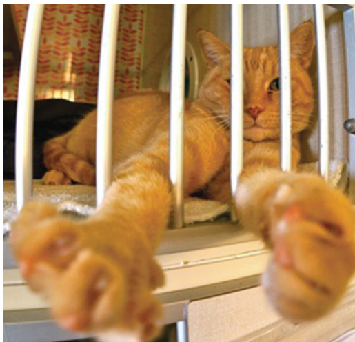
Figure 5 Cat displaying desire for interaction

Perhaps reflecting this, being able to enter the cat's cage was cited as the most important environmental factor in cat selection in one study. 42