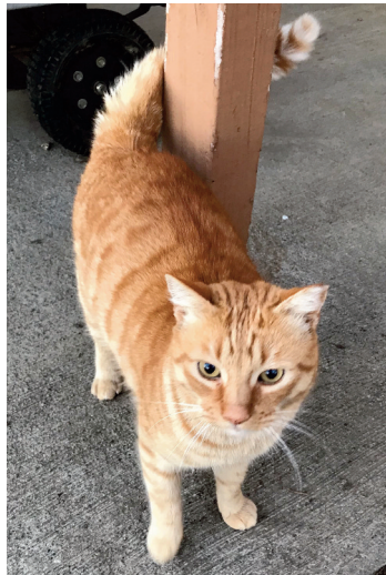
Figure 4 Cats that rub against furniture, toys, etc, have been found to be adopted appreciably more quickly

Allowing cats to participate in their own rehoming by approaching potential adopters may support both cat welfare and adoption. From their earliest origin as domesticated animals, cats have played an active role in choosing to affiliate with humans. 28 It is common to hear an owner proudly say that rather than choosing their cat, 'this cat chose me'. By permitting cats to literally reach out to visitors, rather than enclosing them behind solid partitions, housing design can help recreate the serendipity of a stray that showed up on the doorstep (Figure 5).