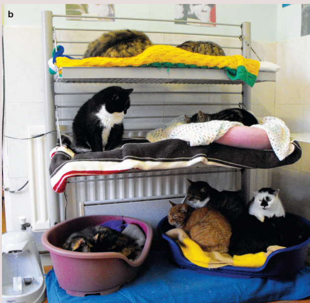
Figure 2 (a,b) These group-housed cats are sharing their beds due to insufficient resources. Several individuals are seen with signs of stress and upper respiratory tract disease – tense body posture, piloerection and narrowed eyes due to ocular discomfort

When considering cats' social needs, in addition to contact with humans, the question of whether to provide contact with other cats must be addressed. Group housing is a controversial issue and, while common in the USA, is rarely practiced in UK shelters. While appropriate for some individuals, cats' generally solitary nature may make this an inappropriate default choice.