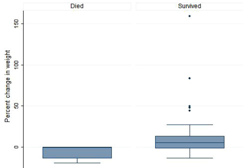
FIGURE 2 Comparison of percent change in weight between dogs who survived and dogs that died at home or were euthanized at the clinic

throughout treatment may be more likely to eat and drink due to treatment of clinical signs. Weight gain could also be associated with maintaining hydration through exogenous fluids provided during treatment or through reduced losses. Although percent change in weight has not been evaluated in previous studies, there have been studies that have suggested that dogs with lower body weight have a poorer prognosis. 15,16 Further research needs to be conducted to determine the significance of this finding. For example, future research could look at changes in weight to help determine the amount of exogenous fluids to give for treatment. Finally, the multivariable regression model shows that for everyday increase in clinical signs, there is a 3.15 increased odds in survival. While it is plausible that dogs who have had clinical signs for longer may have survived because they are better compensating for the disease, these results should be interpreted carefully due to survivorship bias. It is possible that there could be dogs who showed clinical signs longer, but were not accounted for because they died before being seen for treatment.