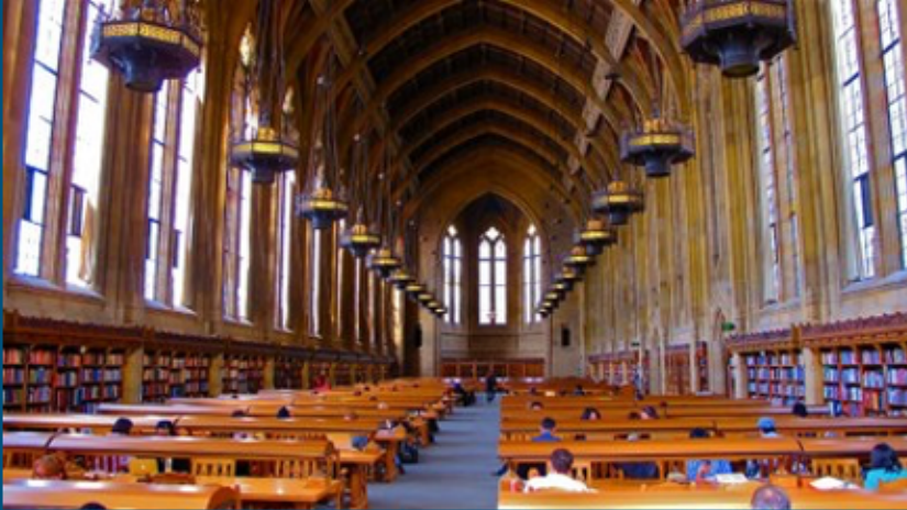
Suzzallo Library - Reading Room - University of Washington