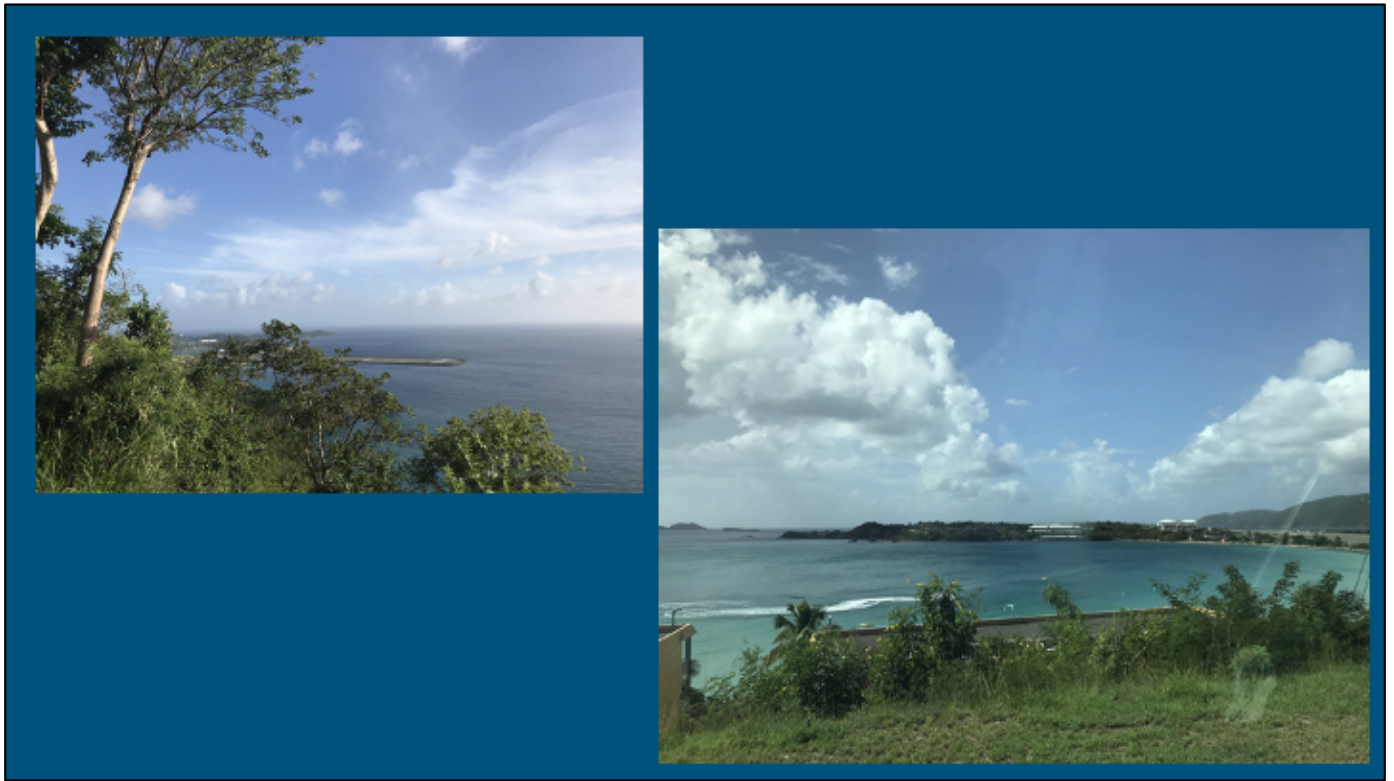
December 2019