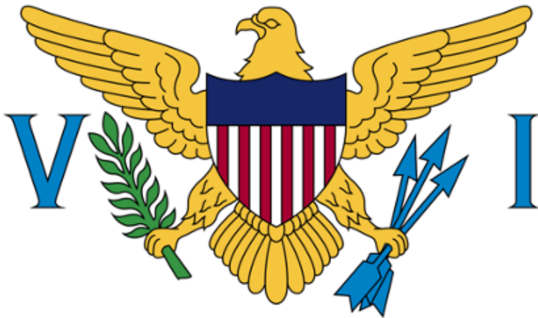
US Virgin Islands - National Flag Virgin Islander Virgin Islands Creole English