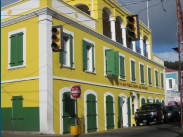
Enid M. Baa Public Library

http://www.virginislandspubliclibraries.org/librarybaa.asp © Copyright - Department of Planning and Natural Resources Division of Libraries, Archives and Museums Disclaimer and Privacy Policy