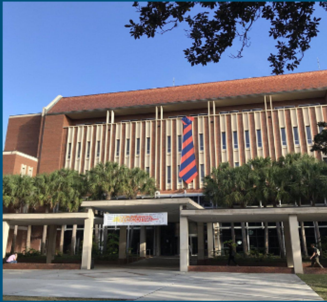
University of Florida - Library West