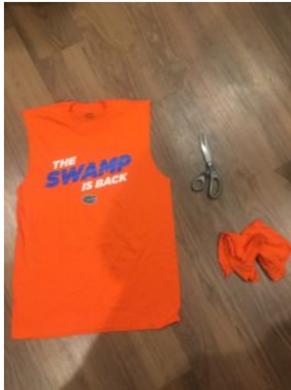
Cut Sleeves off