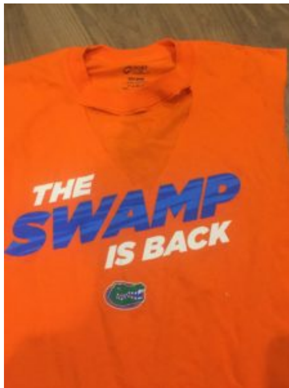
Cut V out to create a choker appearance