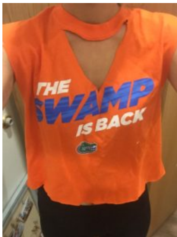
Fun Gameday shirt!