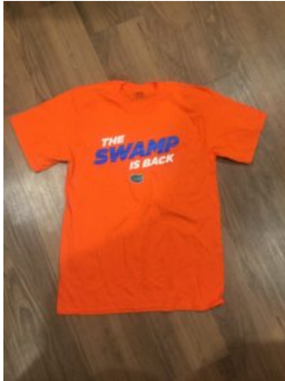
Free UF T-shirt

All college students love free t-shirts, but they don't always look the best. Here are a few tips and examples on how to bring your shirt game to the next level. We've shown a step-by-step on how we turned our "Swamp is Back" shirt into an awesome shirt for game days. Feel free to use the tips below on any shirt, such as the UF2021 shirt you will get at Preview!