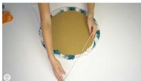
Hanging Pin Board