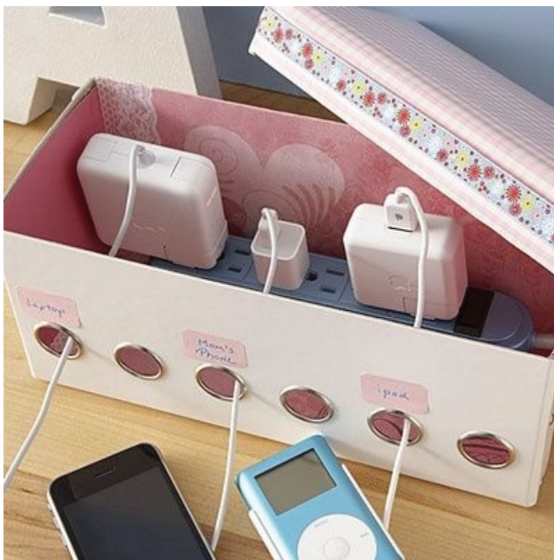
A decorative box hides a power strip