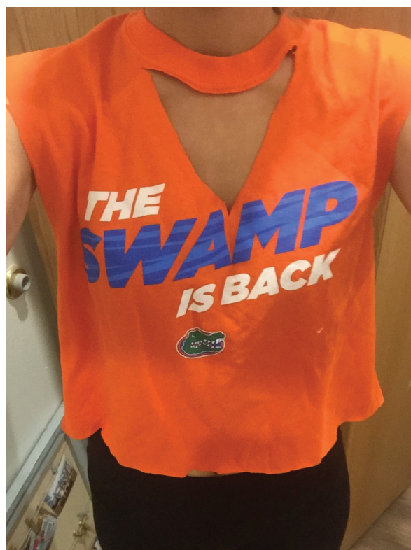
Fun Gameday shirt!