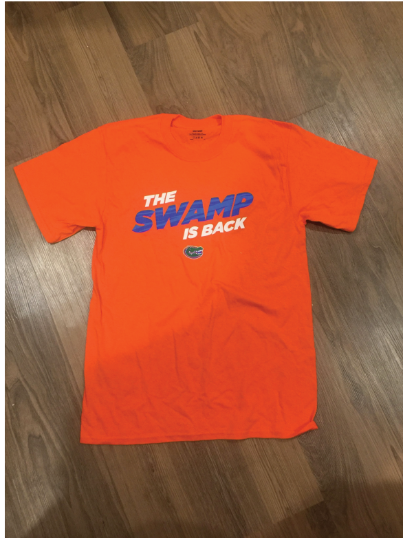
Free UF T-shirt

All college students love free t-shirts, but they don't always look the best. Here are a few tips and examples on how to bring your shirt game to the next level. We've shown a step-by-step on how we turned our "Swamp is Back" shirt into an awesome shirt for game days. Feel free to use the tips below on any shirt, such as the UF2021 shirt you will get at Preview!