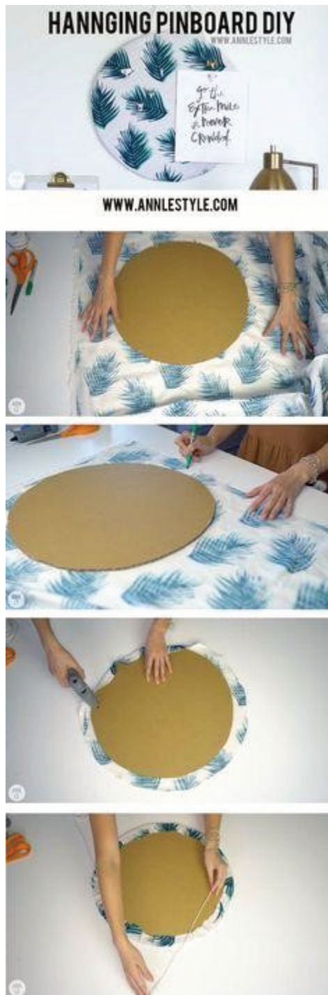
Hanging Pin Board