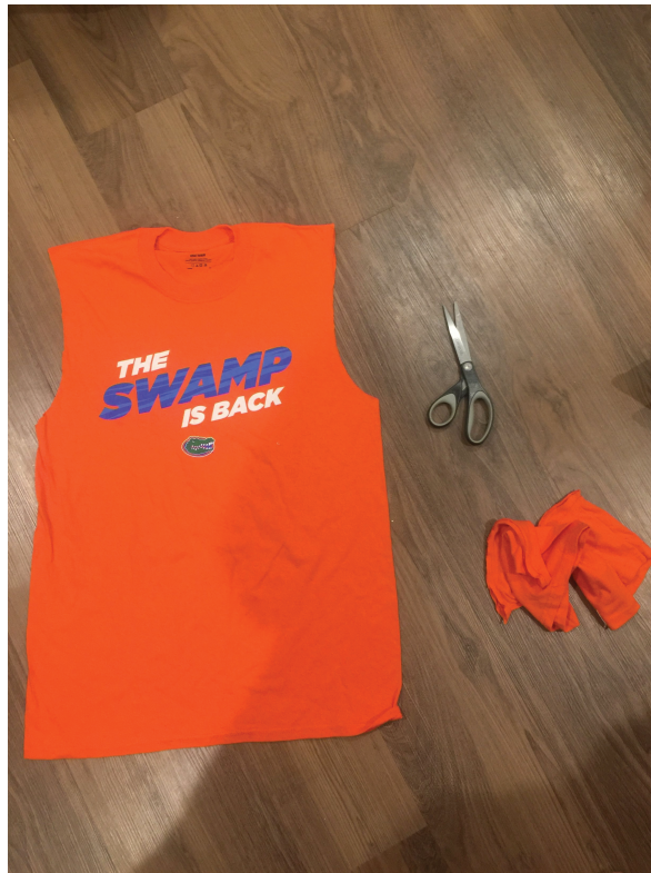
Cut Sleeves off