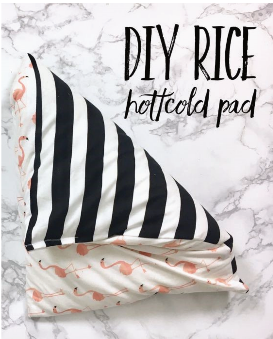
Microwave heating pad