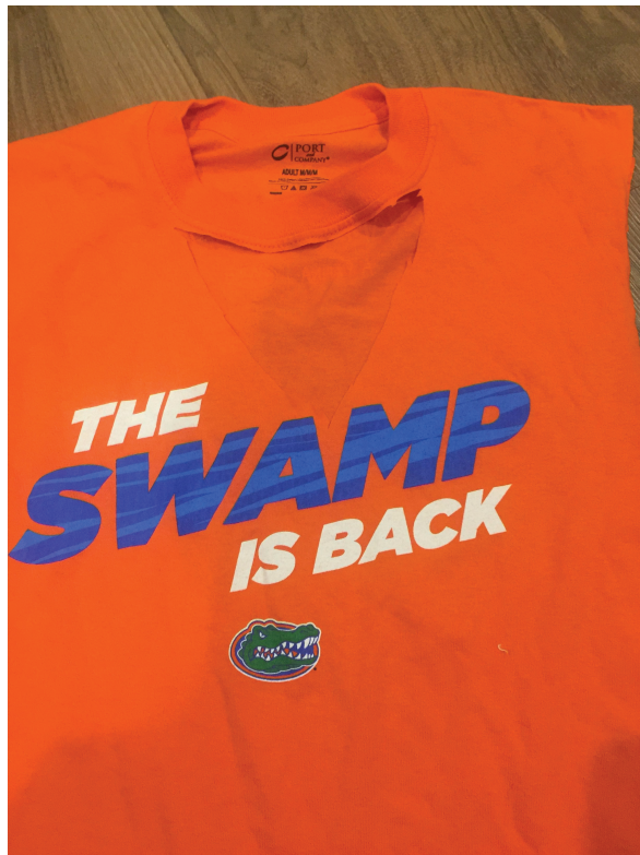
Cut V out to create a choker appearance